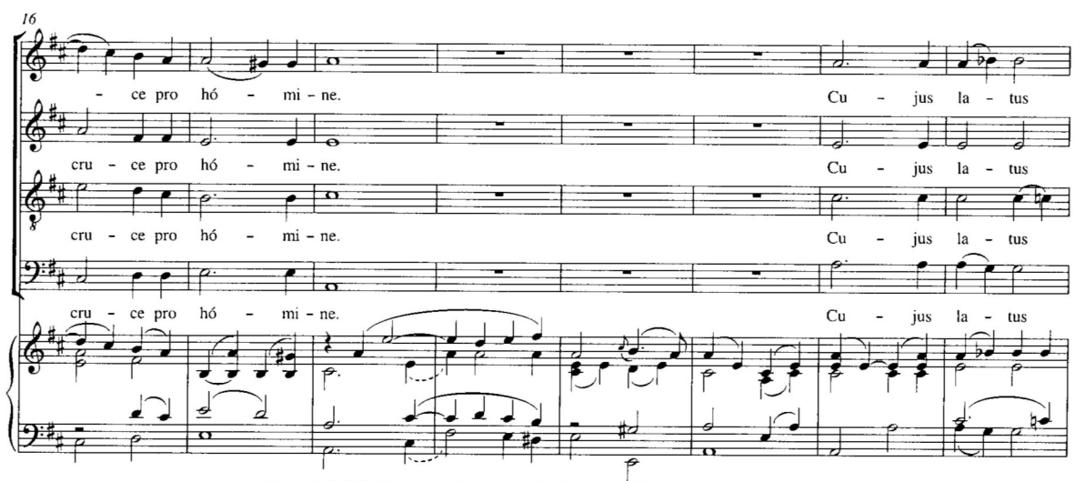
Copyright © 2006 Philip Legge, for the Choral Public Domain Library, http://www.cpdl.org/ Edition may be freely distributed, duplicated, performed, or recorded. All other rights reserved.