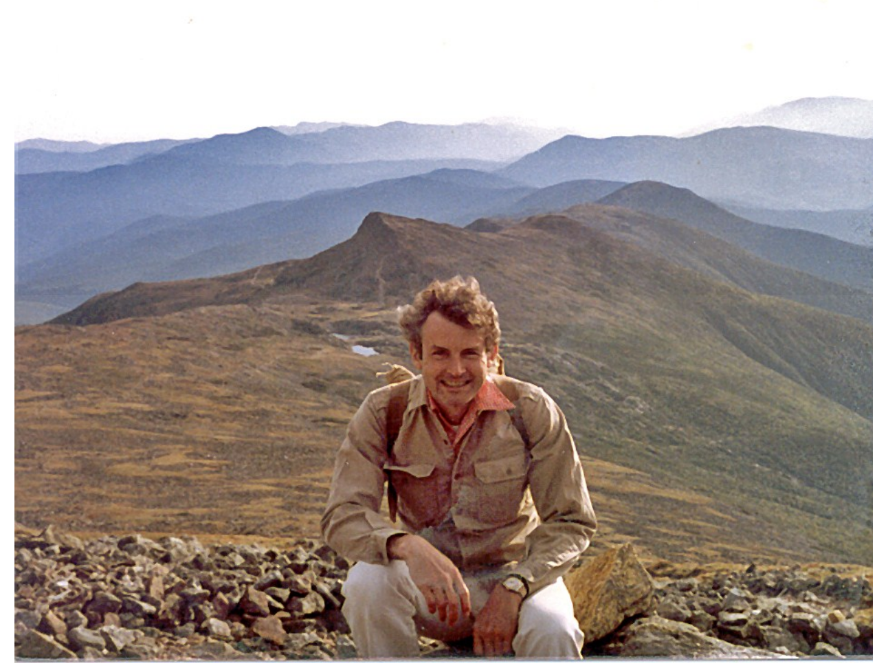
taken September 1983 on Mt. Washington, NH, with the Lakes of the Clouds in the background.